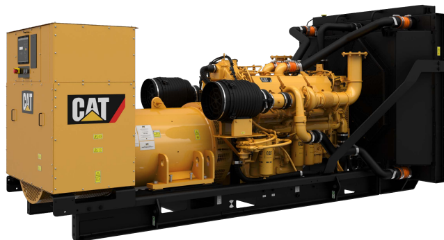
Image shown may not reflect actual configuration